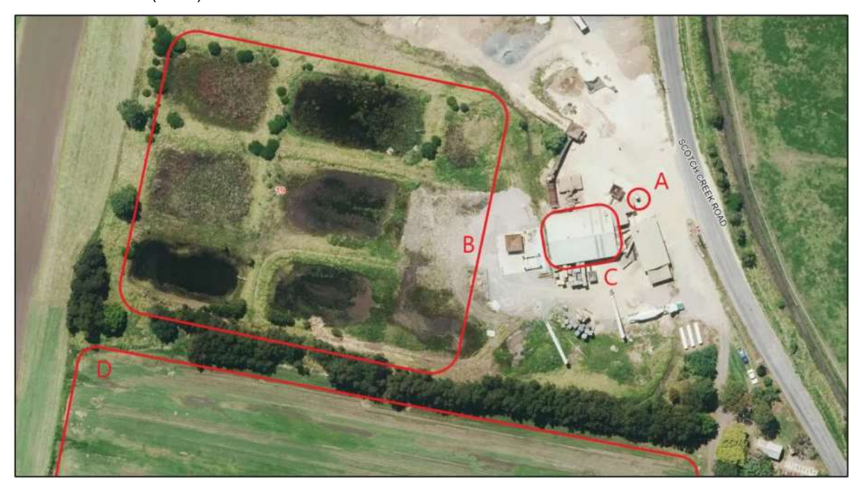
Figure 3: Areas of Environmental Concern (AEC's)

The objective of this assessment is to determine if there are any activities occurring, or having occurred in the past, that could have contaminated the site and impacted on the site suitability for use as a sand and gravel processing industry. In this context it is a site scoping exercise to determine if more intrusive site sampling is required as a second stage to the PCA.